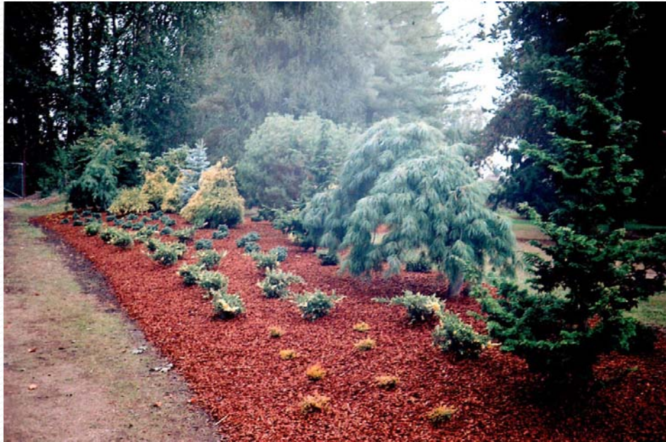
Entrance at 13 th Ave. and Meadow Dr.